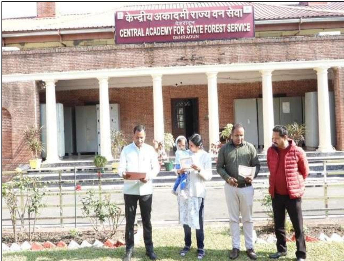
Constitution Day 26 November, 2024