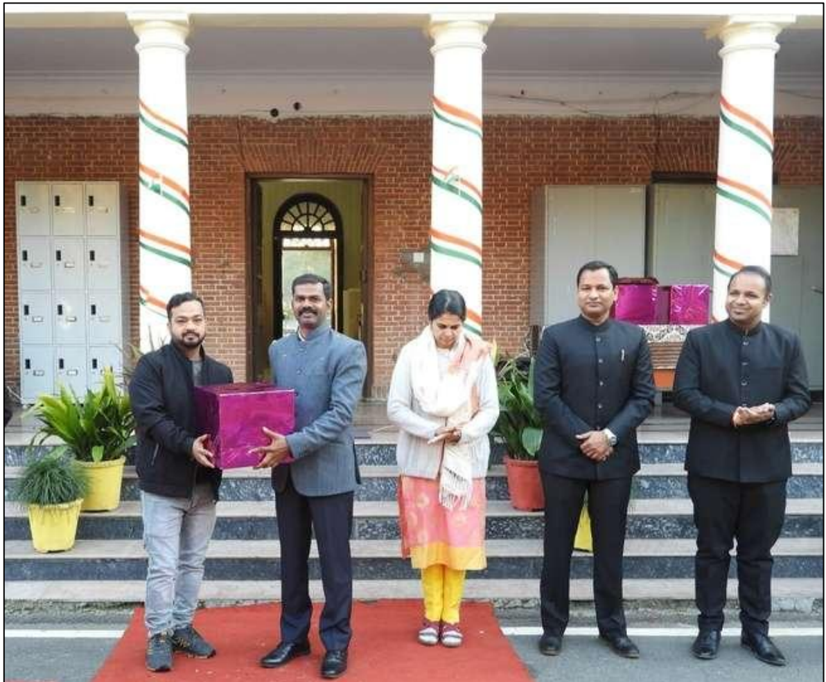
Republic Day 2025