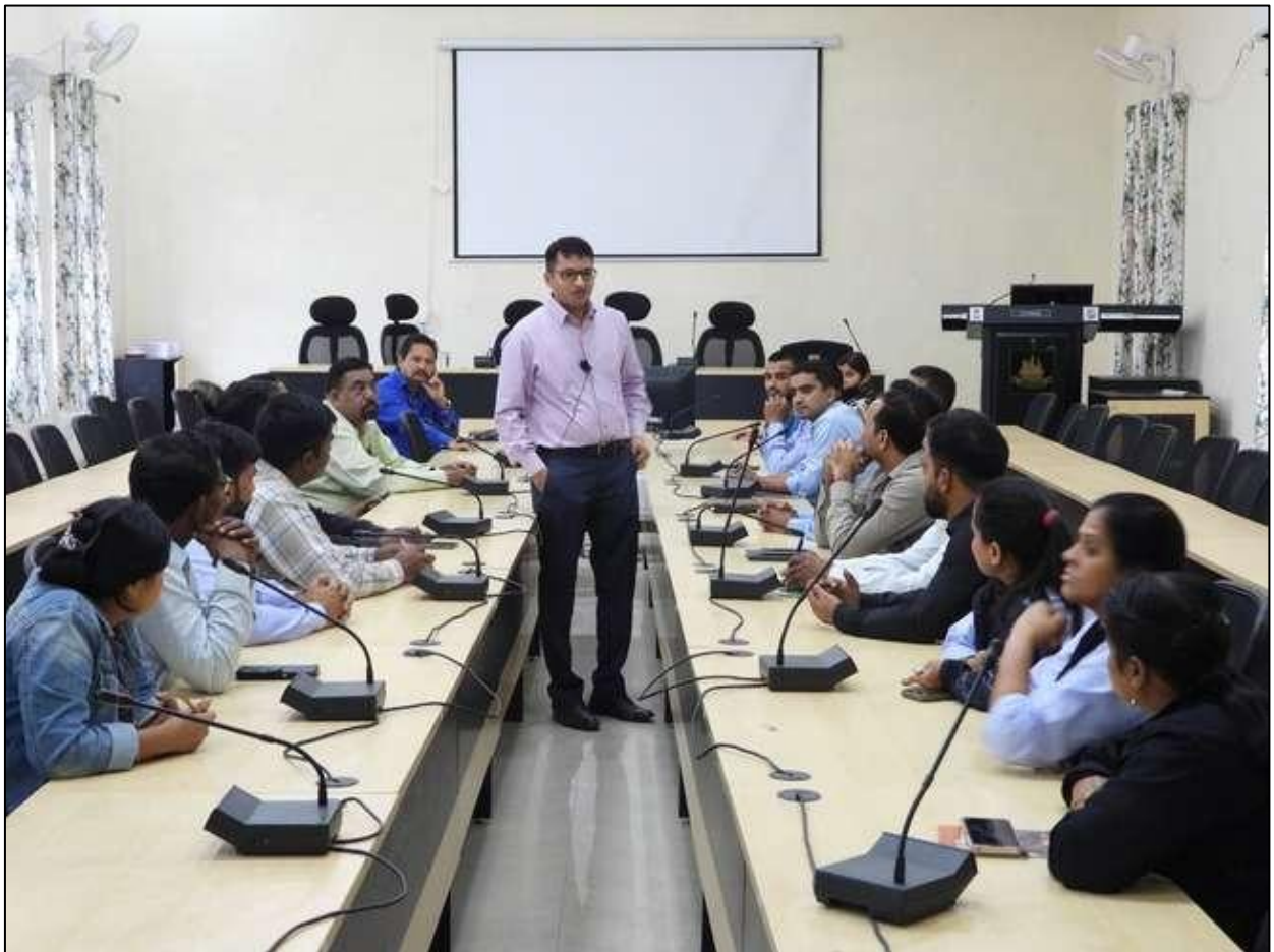
Activities under Vigilance Awareness Week 2024