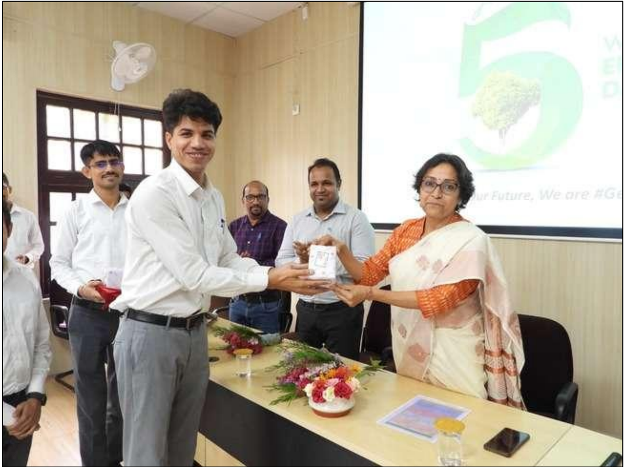
World Environment Day 2024