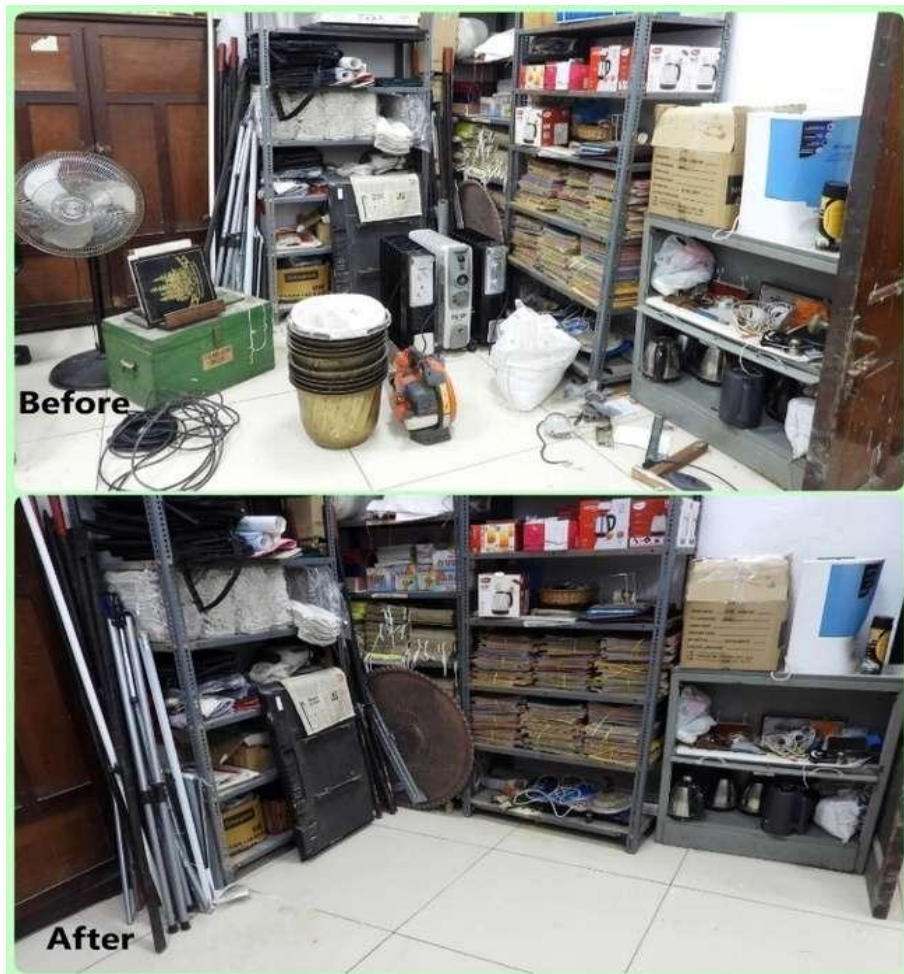
Special Campaign 4.0