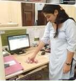
Swachhta Abhiyan on 02 nd October 2024