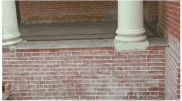
Pilot restoration of the worn-out bricks in the historic CASFOS building