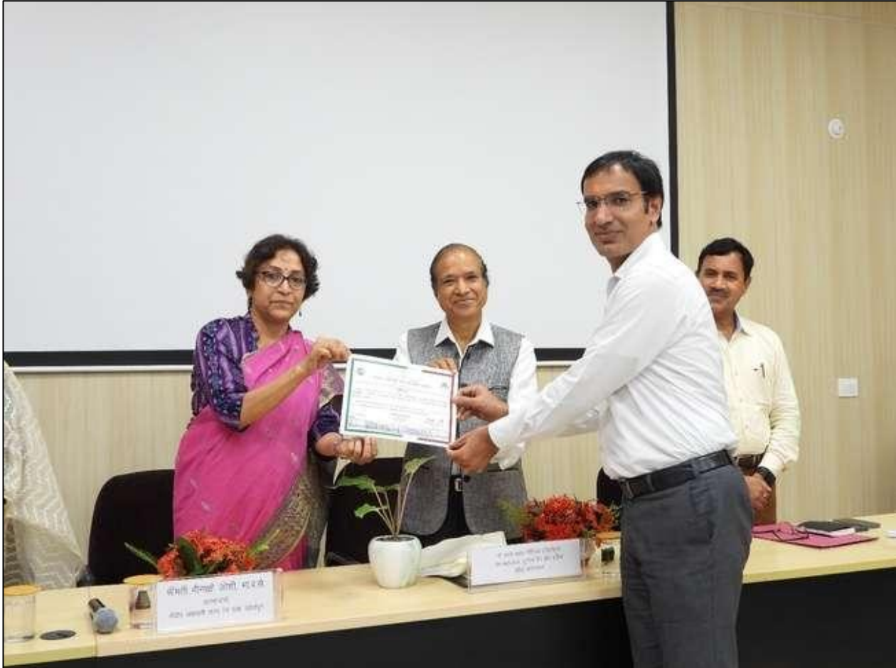
Rajbhasha Pakhwada 13-27 September 2024