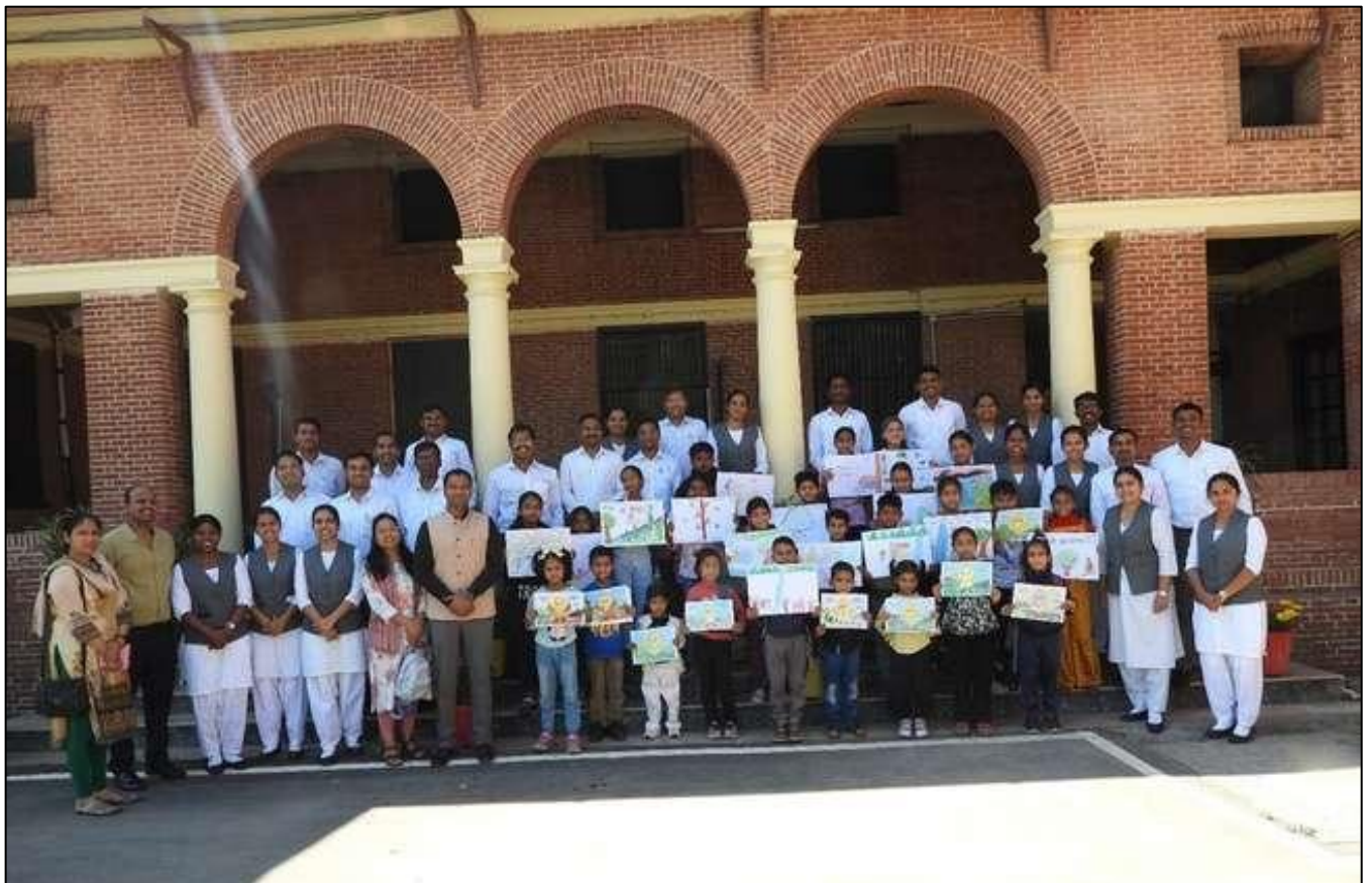
World Sparrow Day 20 th March 2025