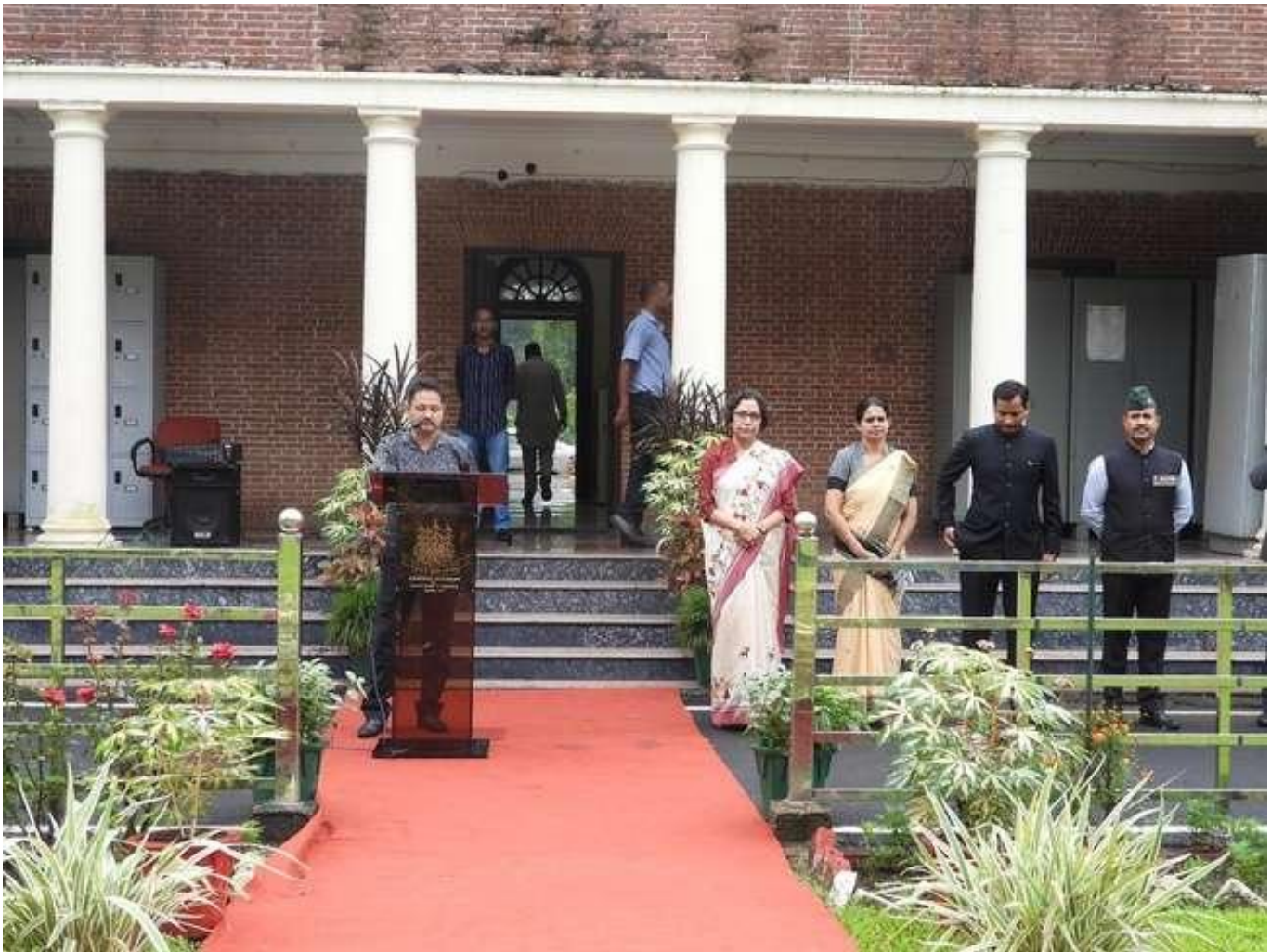
Independence Day Celebration 2024