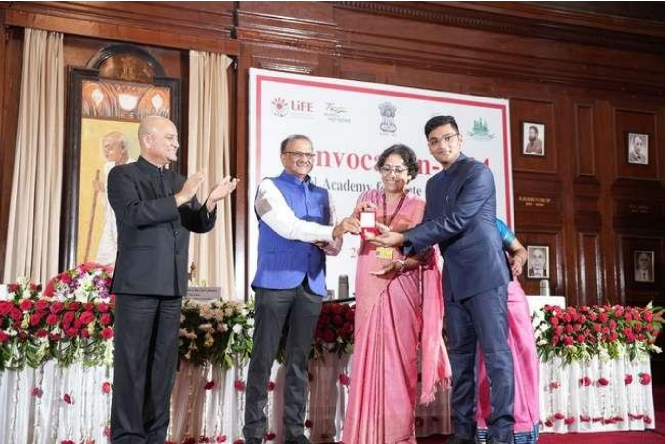
Convocation Batch 2022-24