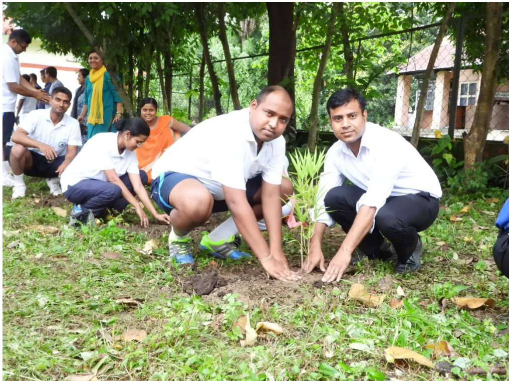
Van Mahotsav celebration on 25 th July, 2020