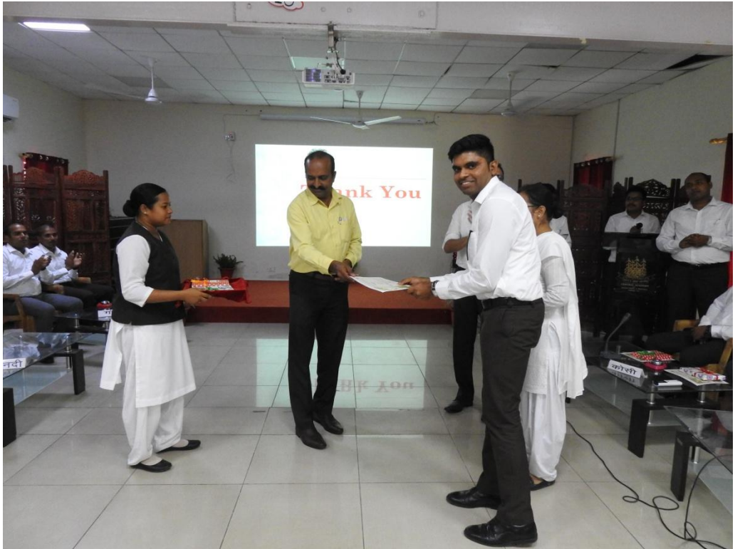
Quiz Competition on 16 th May,2020