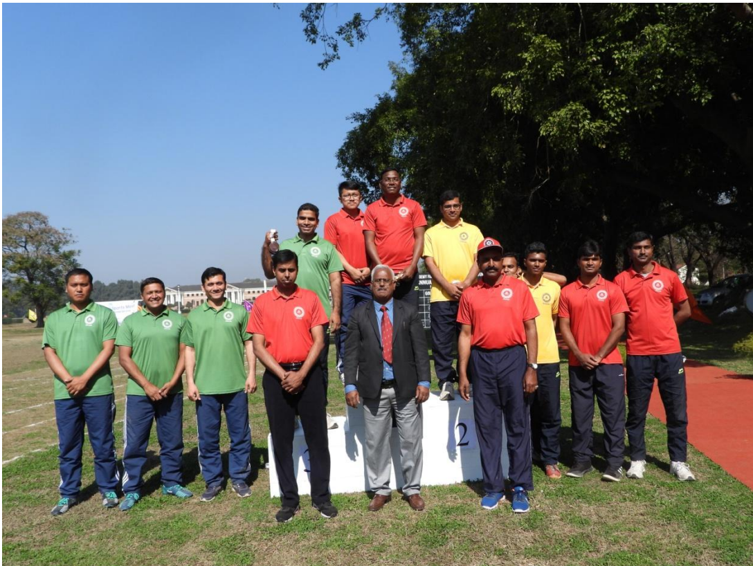
Intramural sports meet on 13 th to 15 th February,2020