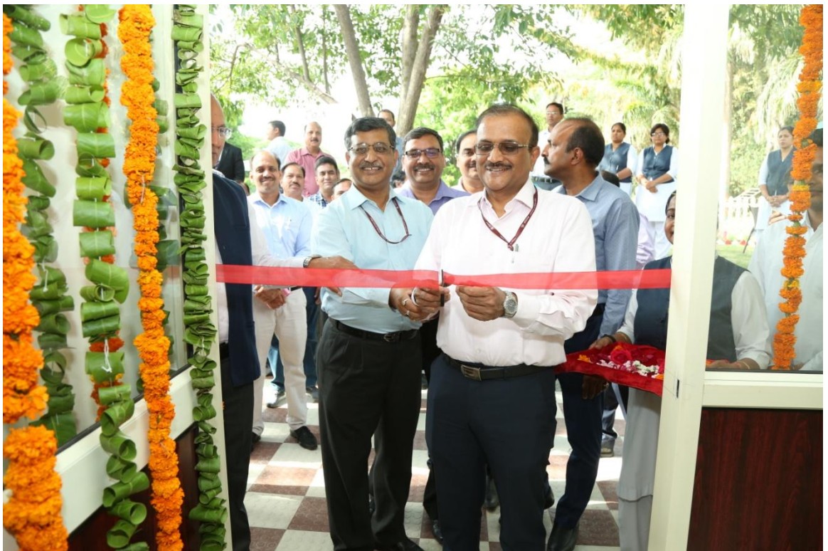
Inauguration of VIP Guest House on 30 th April, 2019