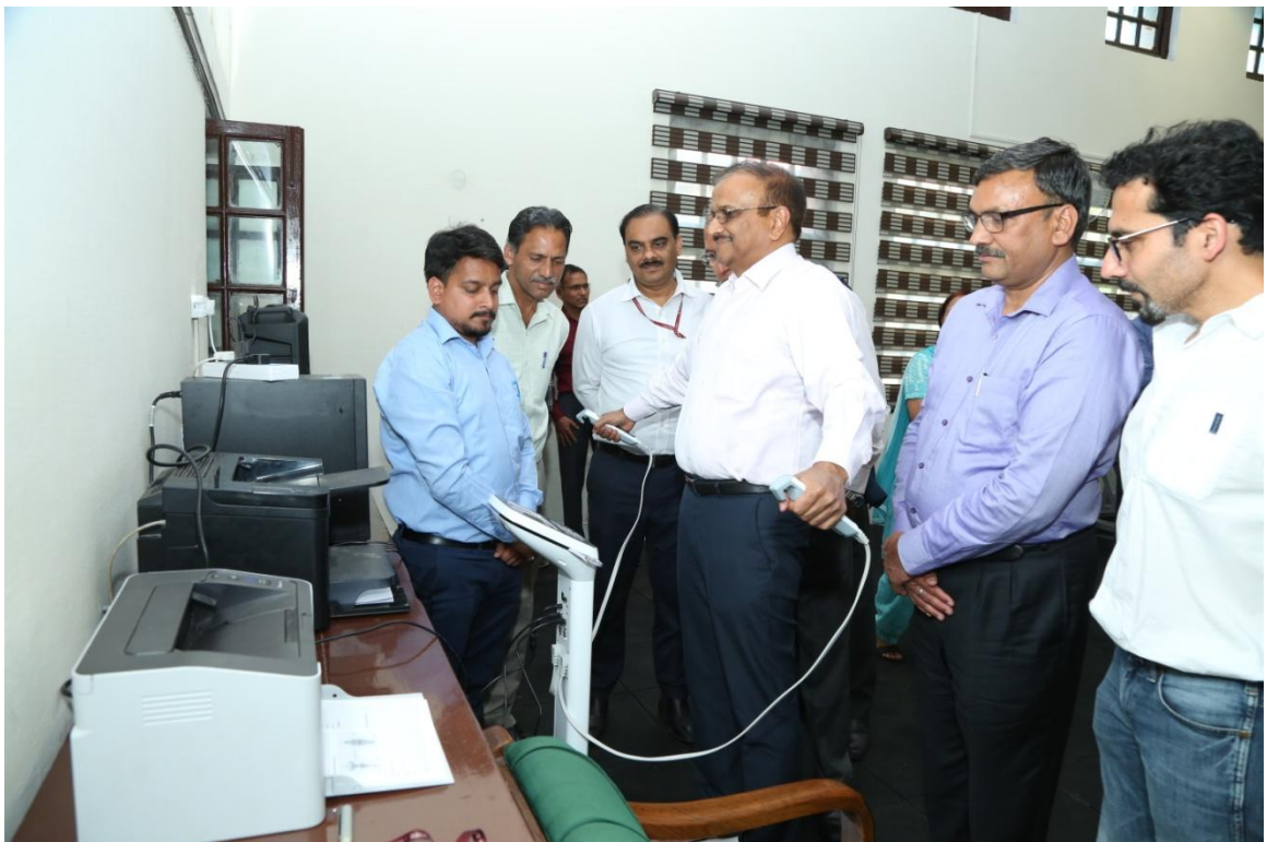
Inauguration of new gymnasium on 30 th April,2019