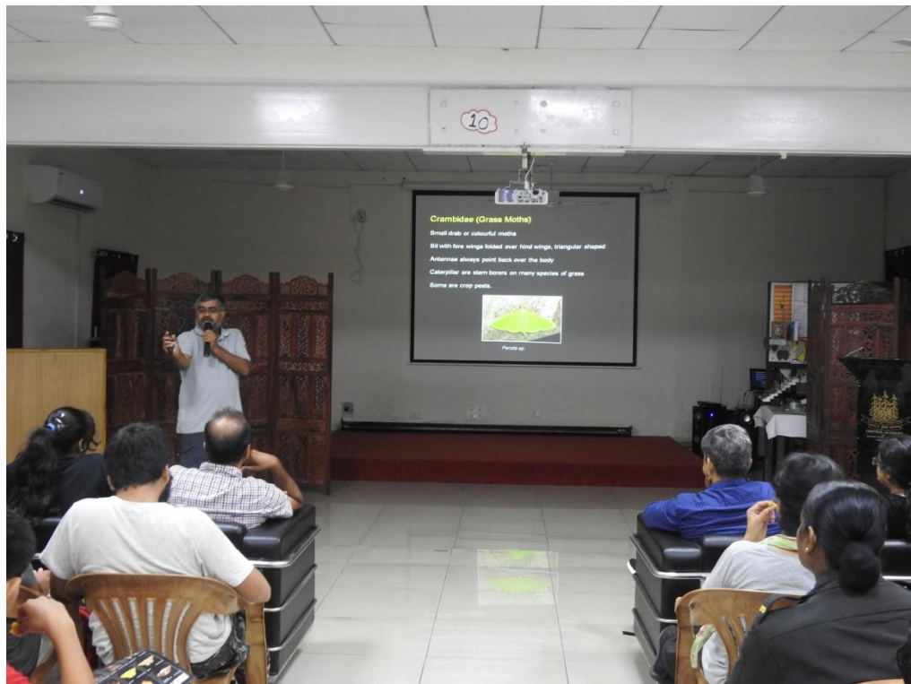
Moth week celebration on 27 th July, 2019