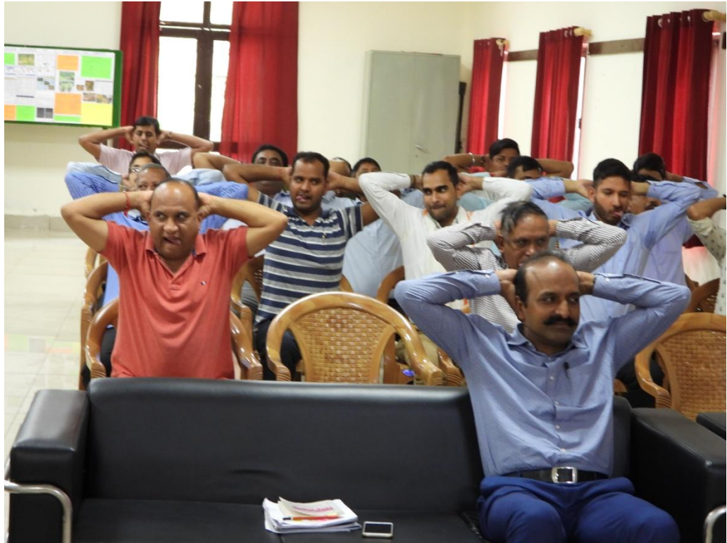
Yoga for staff members on 05 th September,2020