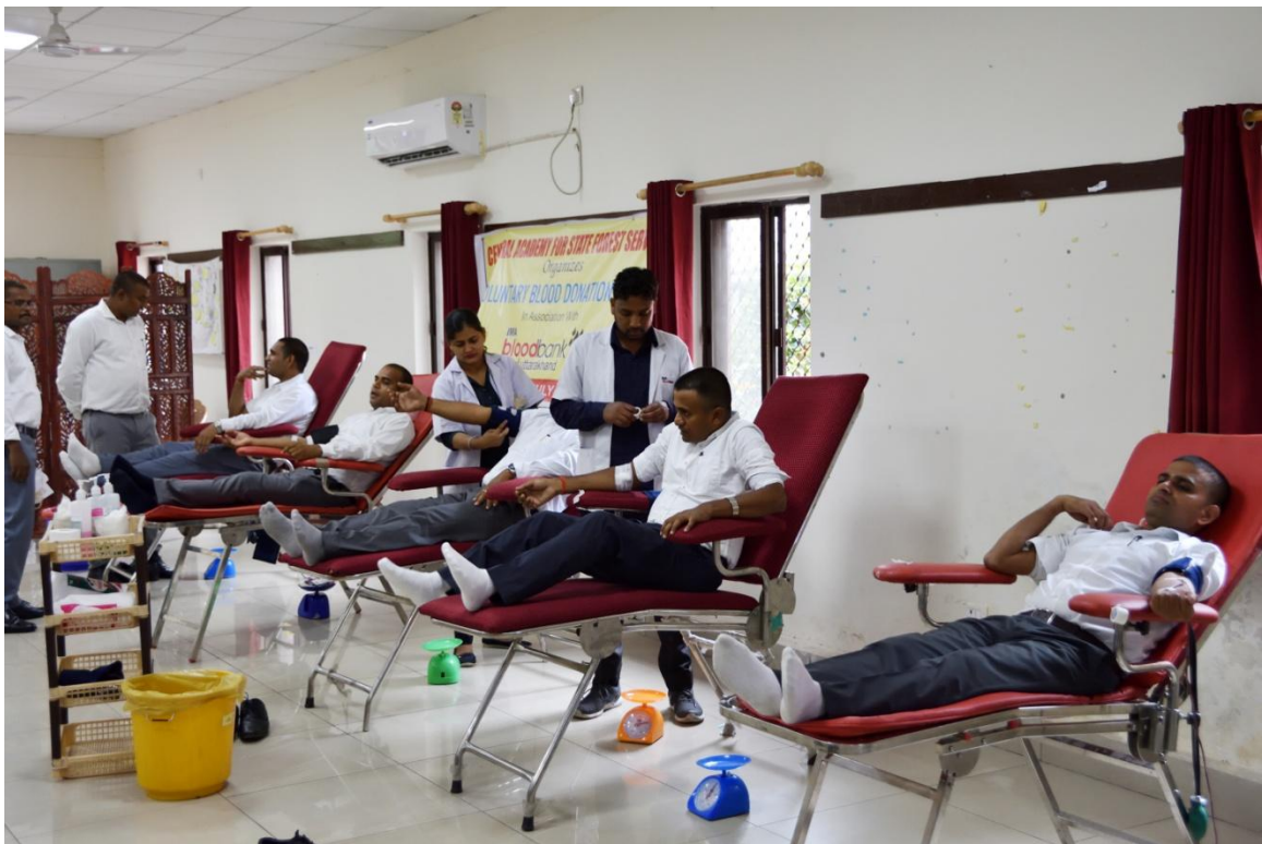
Blood Donation Camp on 15 th January, 2020