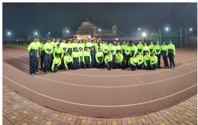
24 th All India Forest Sports Meet