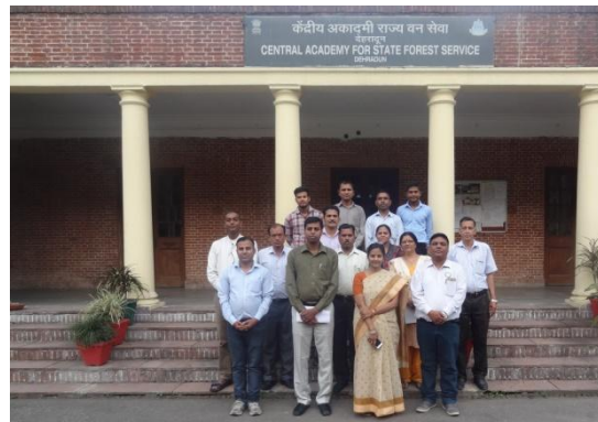
Computer Training for Staff