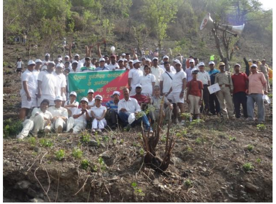
Mission Rispana to Rishiparna