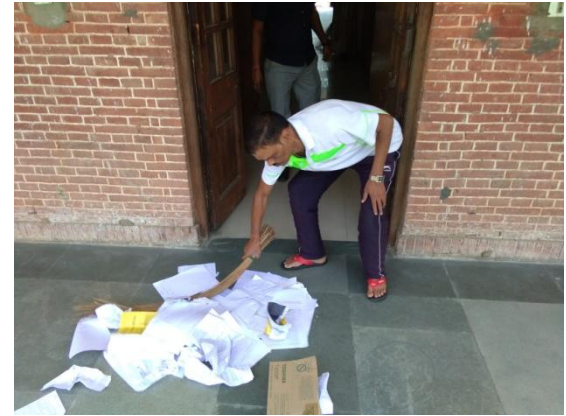
Swachh Bharat Abhiyan