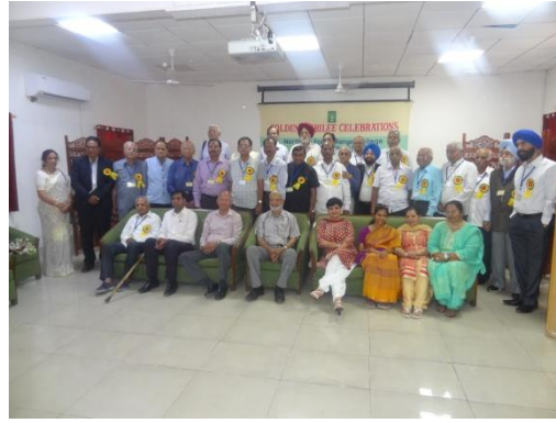
Golden Jubilee Celebration