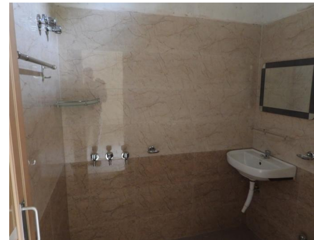
Repair & renovation of barrack