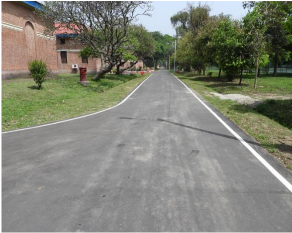
Repair & Resurfacing of road