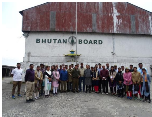
East India Tour