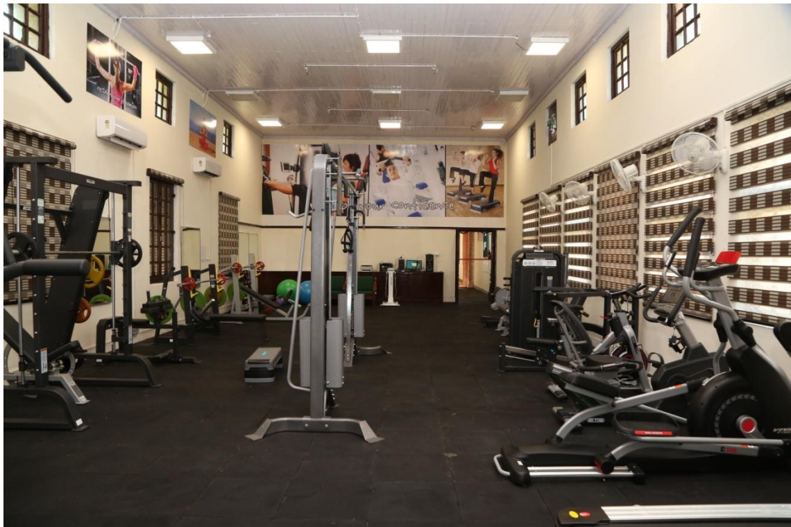
Gymnasium with new Gym equipments