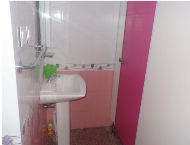
Renovatio of Ladies Toilet