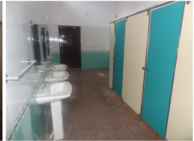
Renovatio of Gents Toilet