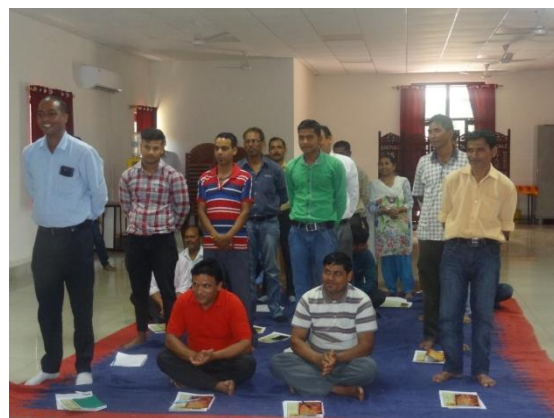
Bee Keeping Training for Staff